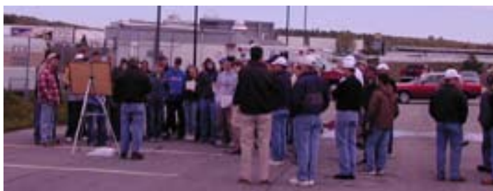
Learning fundamental principals in "the classroom".

Then it was off to the emergency lane change location. This is a demanding exercise for inexperienced drivers. Avoidance is the key principle. It is the key element in the engineering of all BMW's. Knowing when to steer and brake is invaluable to young drivers. It feels good to know that these young people learned and built confidence around cones. Out of all the exercises, this one will save more lives. It also put more smiles on faces