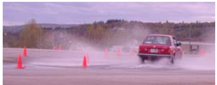
Learning "hands on" about vehicle dynamics with focused, one-on-one, in-car instructor training.

than a NASCAR race day at NHIS. I spent most of my time shagging cones at that station.