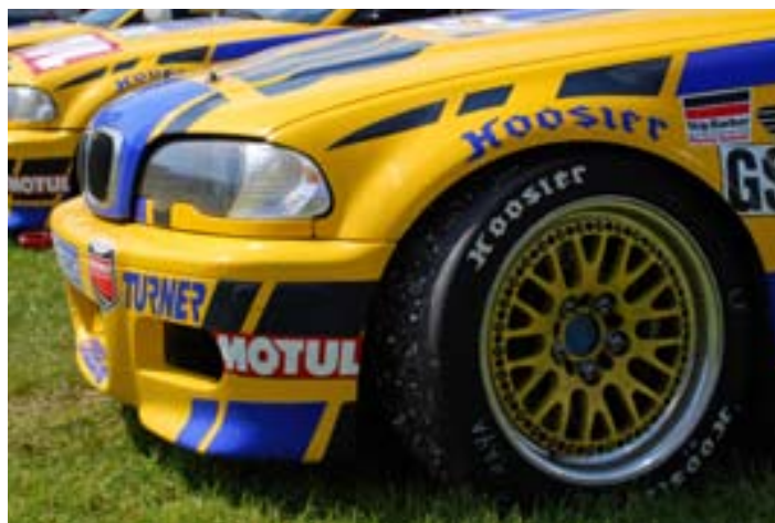
Beautiful and impressive machines from one of Laura's favorite race teams, Turner Motor Sport.