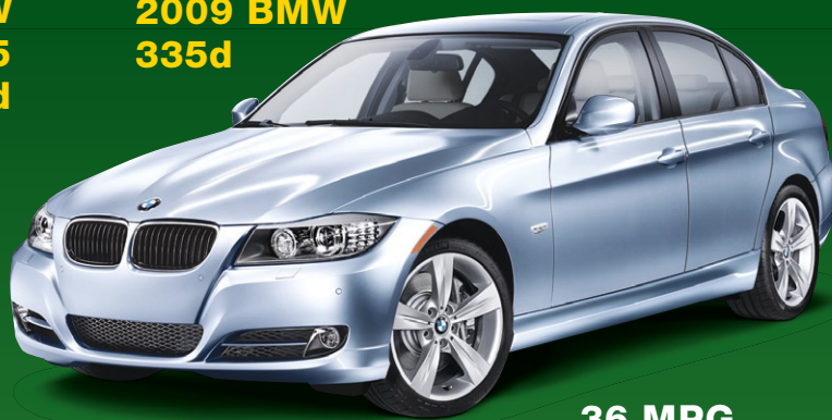
2009 BMW 335d