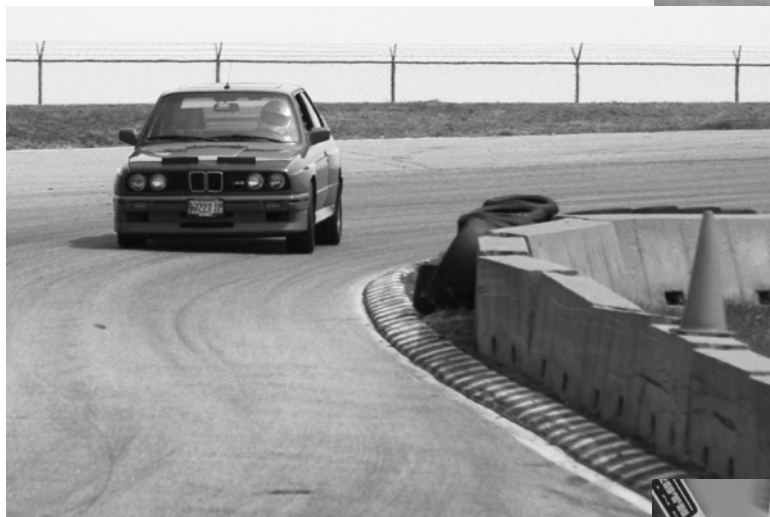
Nice and easy - Finessing Turn 9

The weather was perfect and our driving instructors shined. Our students displayed talents of experience all throughout the day. We are proud to have had yet another incident free day running five run groups, four sessions each. For some that was upwards of a hundred track miles logged in a day!