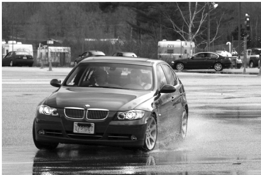
ADSS at NHMS with the WMC - Unlike any other "school" you'll ever attend!

the Profile has ad space available! various sizes and rates