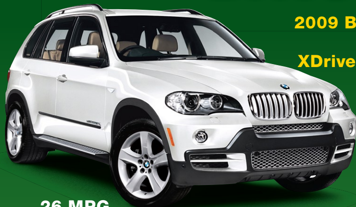
2009 BMW X5 XDrive35d