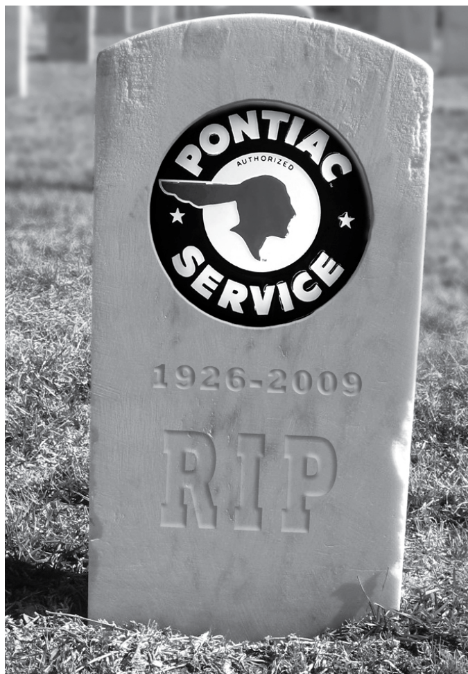
An icon of American automotive heritage is laid to rest

So what went wrong? I hold up the Aztec as an example of the failure of a corporation able to make some decent muscle cars venturing into unfamiliar waters. They drifted away from their roots and began developing boring cars and "practical" people movers. This made no financial sense to me. The same path was followed by Chrysler who was the genesis of