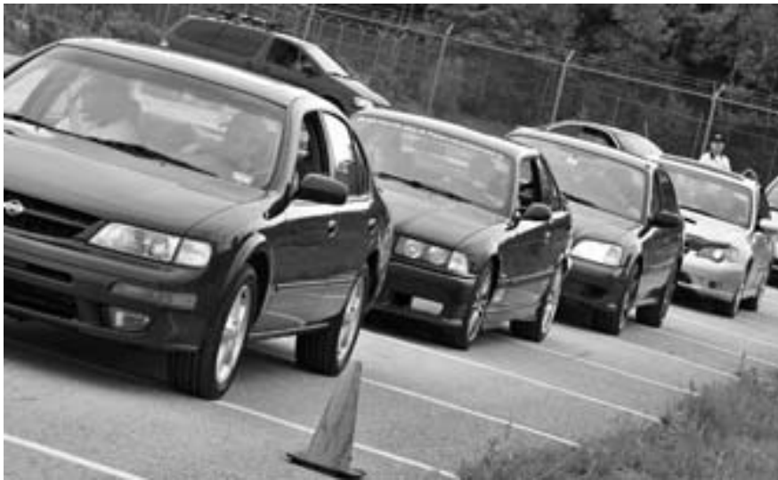
above: All queued up and ready to learn.