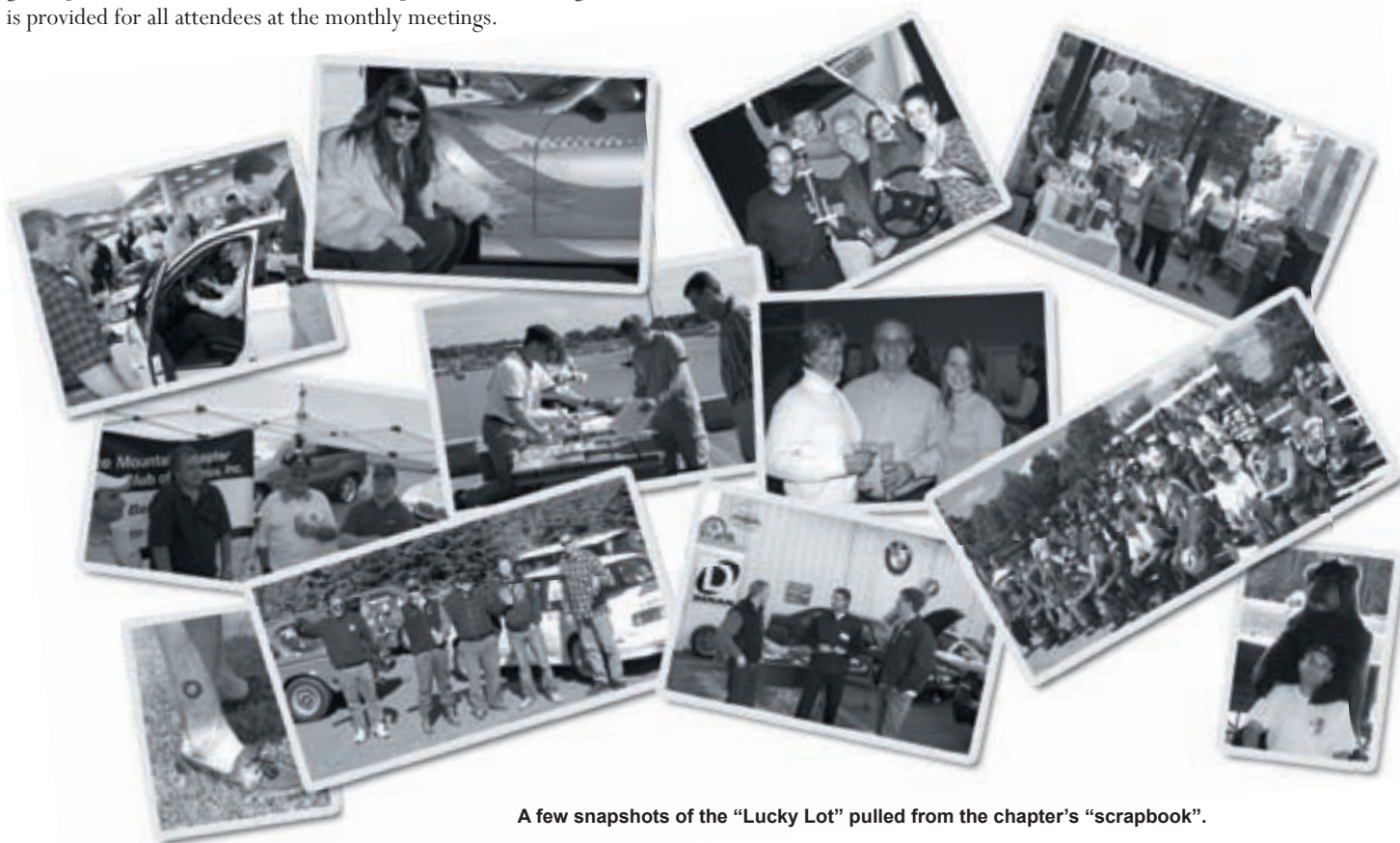
A few snapshots of the "Lucky Lot" pulled from the chapter's "scrapbook".