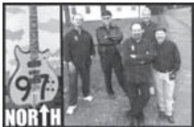
The renowned "feel-good" classic rock band, 97 North , will entertain the masses at the Winter Reunion Party 2010

With the summer in full swing, it seems hard to think of any event that happens in January! The Social Events Committee (SEC) is not daunted by such thinking. We are in the throws of organizing the 2010 Winter Reunion Party. As in the past, the party will be held in January and will feature excellent food and music.