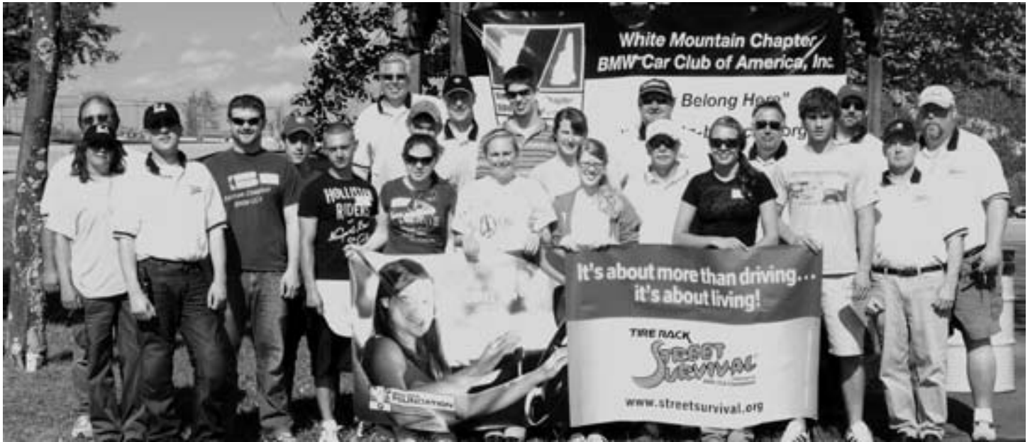
The Students and Instructors of this year's White Mountain Chapter Tire Rack Street Survival drivers school at New Hampshire Motor Speedway.