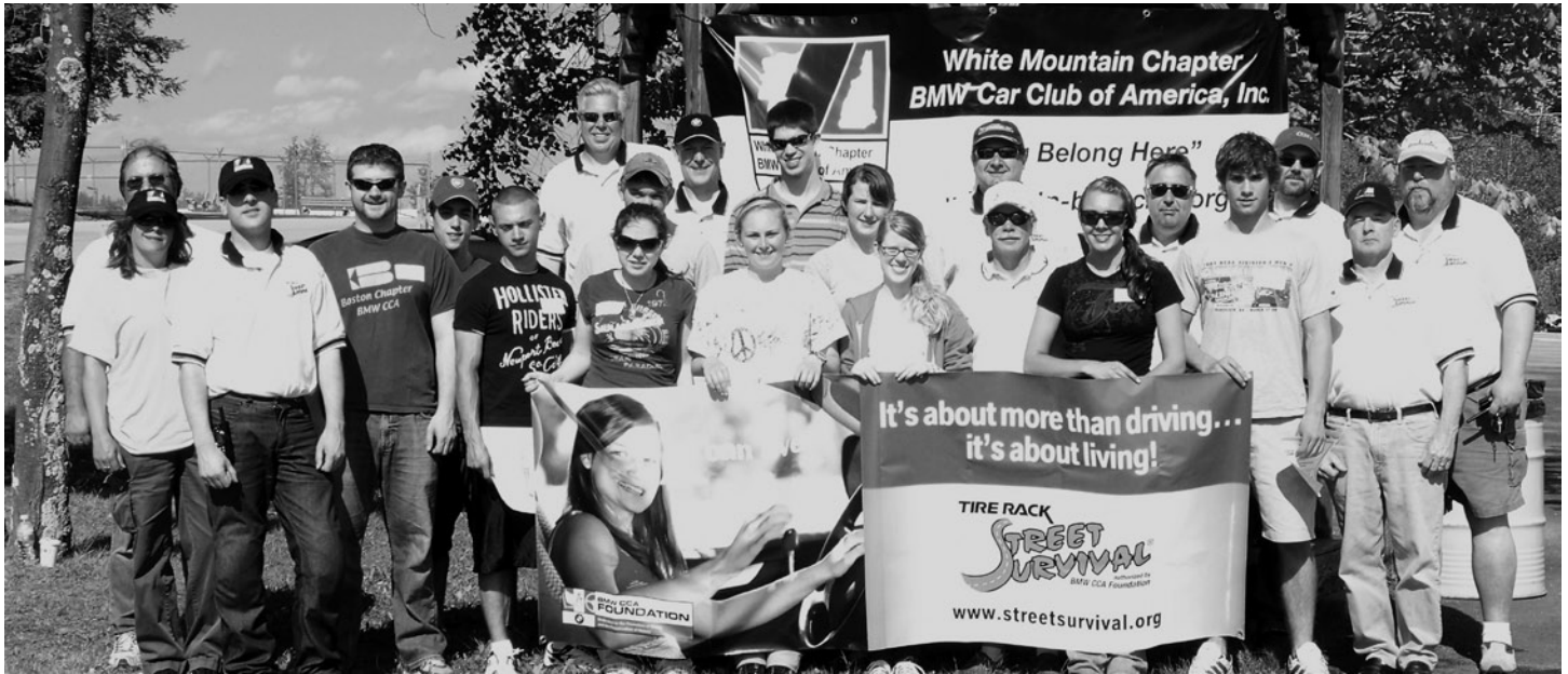
The Students and Instructors of this year's White Mountain Chapter Tire Rack Street Survival drivers school at New Hampshire Motor Speedway.