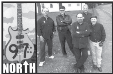
The renowned "feel-good" classic rock band, 97 North , will entertain the masses at the Winter Reunion Party 2010

With the summer in full swing, it seems hard to think of any event that happens in January! The Social Events Committee (SEC) is not daunted by such thinking. We are in the throws of organizing the 2010 Winter Reunion Party. As in the past, the party will be held in January and will feature excellent food and music.