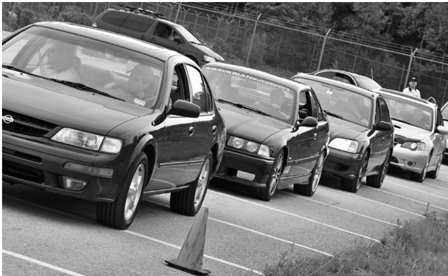
above: All queued up and ready to learn.