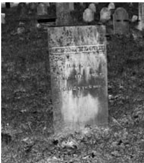
A Hauntingly different Back Roads Rally. Make the drive... if you dare!

From noon until 1 pm participants may pick up a directions packet for $10 per vehicle. Both events will proceed regardless of weather conditions.