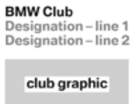
BMW AG's new design standard for CCA chapter logos