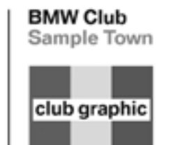
sample of a newly redesigned CCA chapter logo

Construction of new BMW Club logos using the new design standards