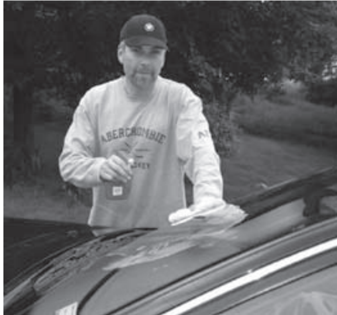
A new and clean windshield is a beautiful thing

My insurance company responded to my inquiry regarding coverage for repairs. The 740's windshield was beyond repair and needed to be replaced ASAP. A few earlier phone calls revealed that a factory replacement would cost $800 plus labor. Well, I figured that is why I pay my insurance company the