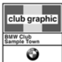
sample of a current CCA chapter logo