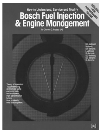
Bosch Fuel Injection & Engine Management and the BMW 'n' Series Service Manuals (Bentley Publishing)- the most useful manuals available for broadening your BMW mechanical knowledge.