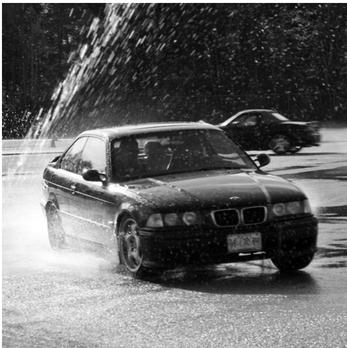
High Performance Drivers Ed, BMW CCA Club Racing and Advanced Driver Skills School at New Hampshire Motor Speedway in 2009.

weather and an eclectic mix of cars including a Chevy Cobalt, 400 hp Subarus, supercharged Mustangs and even station wagons. So for all of you on the side lines wondering if you can attend a BMWCCA event without a BMW the answer is yes. Even though we're a BMW club we welcome and encourage all makes and models at our events. If you're not driving a BMW we'll make fun of you a little bit but we'll still hand you a beer at the end of the day. So come on out and play!