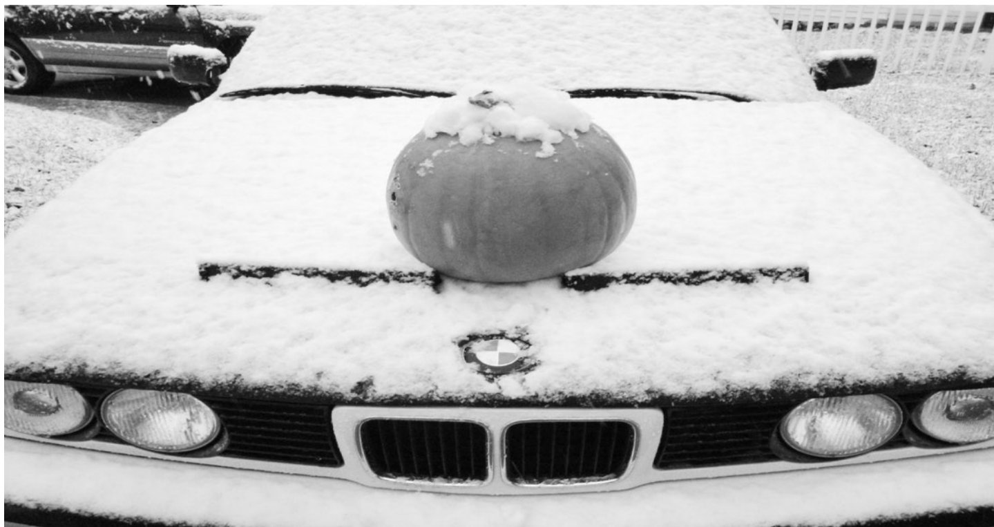
A little more than frost on the pumpkin for this year's rally.

the 2010 Haunted Rally for next year so watch for the future date and event information. No guarantees for the weather forecast. This is New Hampshire.