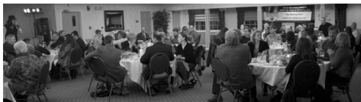
The Winter Reunion Party: a gathering of friends old and new.

Every spring each and every chapter sends out this annual message to the loyal fans of the Blue with White. It's easy to see why club events are mostly scheduled for the warmer months. That is when a majority of our activities occur and members become aware of all the fun and sun that can be enjoyed in the company of fellow enthusiast. Track events, show and shines, drives, brunches, and picnics are best suited for the fair weather.