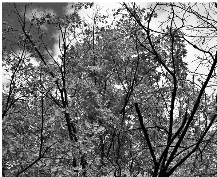
Stunning fall foliage overshadowed the eerie grave sites in the Pine Hill Cemetery of Hollis.