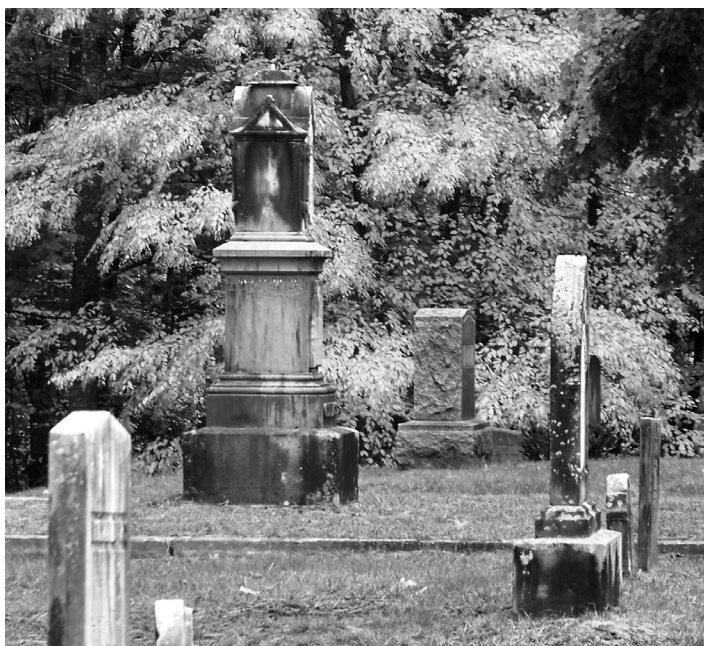
▲ In the spooky Vale End Cemetery of Wilton.