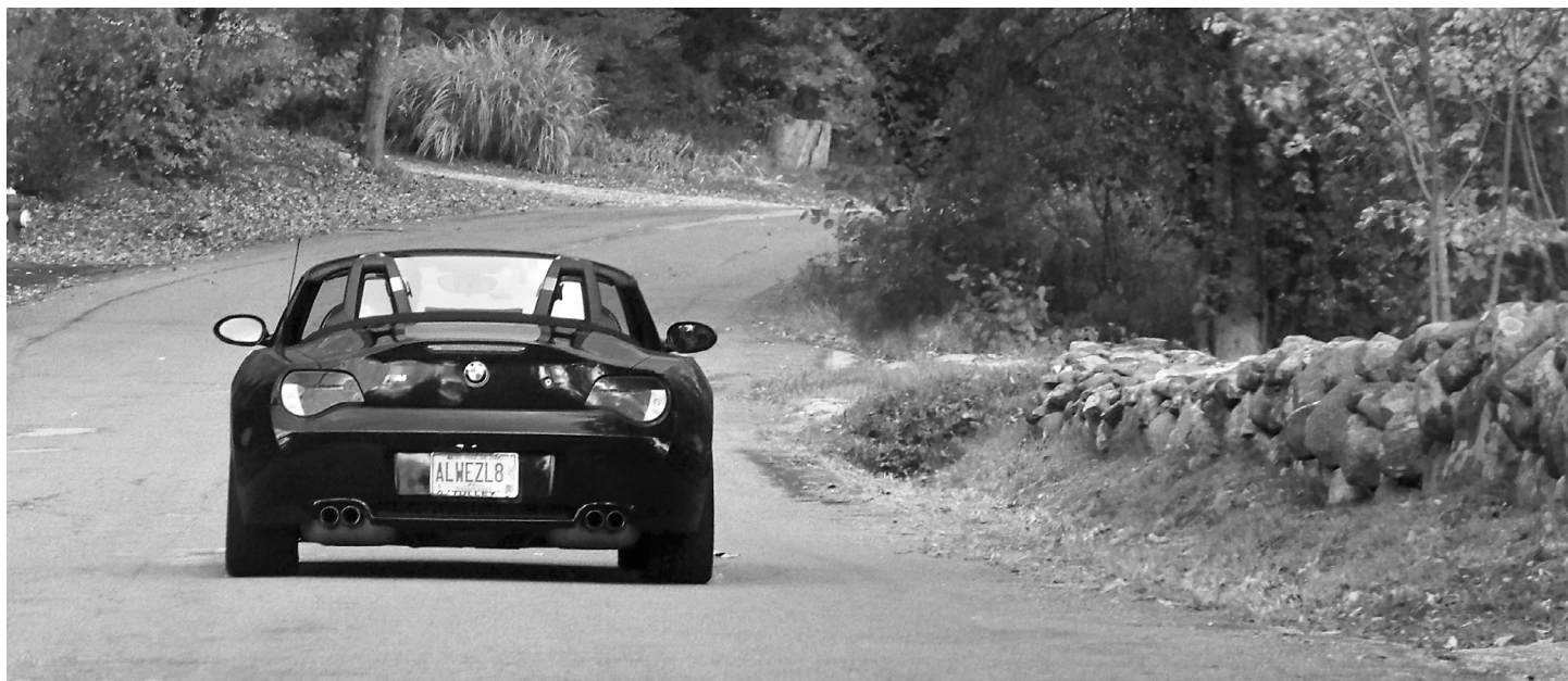
Carving up the beautiful autumn New Hampshire countryside.

The WMC held its long anticipated Haunted Rally in October. This Back Roads Rally, snowed out in 2009, necessitated a reschedule for 2010. With improved weather this year, on Sunday the 17th, over 30 adventurous participants arrived at the Merrimack starting point.