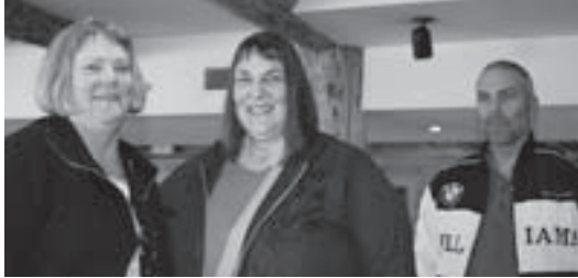
Out and about at a recent Drive and Dine and an Advanced Driving Skills School .