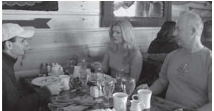
At the Lakehouse Restaurant in Meredith. (Read page 4.)