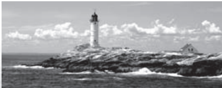
The White Island lighthouse.

This will be the second annual Isles of Shoals WMC Chapter cruise. Join fellow chapter members and board the M/V Thomas Loughton at 8:55 on July 15th at the Isle of Shoals Steamship Company which is located on the commercial waterfront in Portsmouth, New Hampshire. We'll leave our cars at the dock, just relax for the rest of morning and enjoy the high seas on the cruise ship. Tickets are $34 for adults, $24 for 12 and under, kids 5 and under sail for free. The cruise takes approximately an hour to reach the shoals. Once there, you can enjoy Star Island with a self guided walking tour for about 90 minutes before returning.