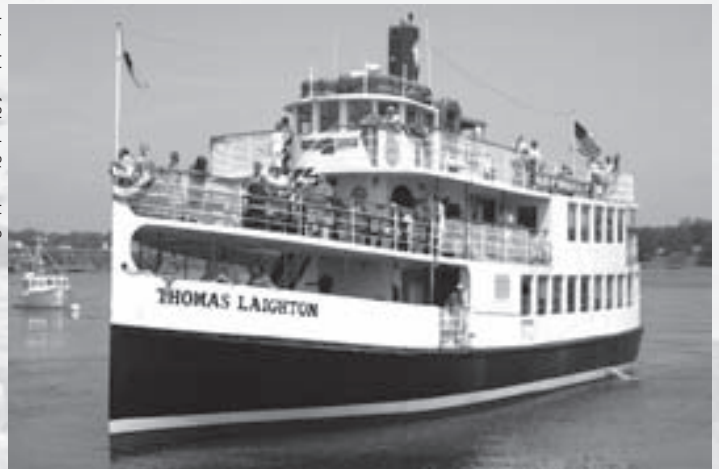
The M/V Thomas Loughton of the Isles of Shoals Steamship Company.

Why not turn this event into a perfect "summer weekend getaway"? Portsmouth has historic charm, great shopping, a huge variety of restaurants, a lively night life and lodging for every budget. —ed.