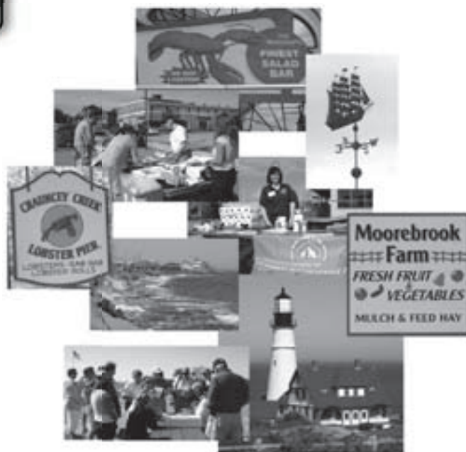
Memories of the 2007 Back Roads Rally. (Read page 4.)

If this doesn't sound like a car load of top down fun, then you're probably in the wrong club. -ed.