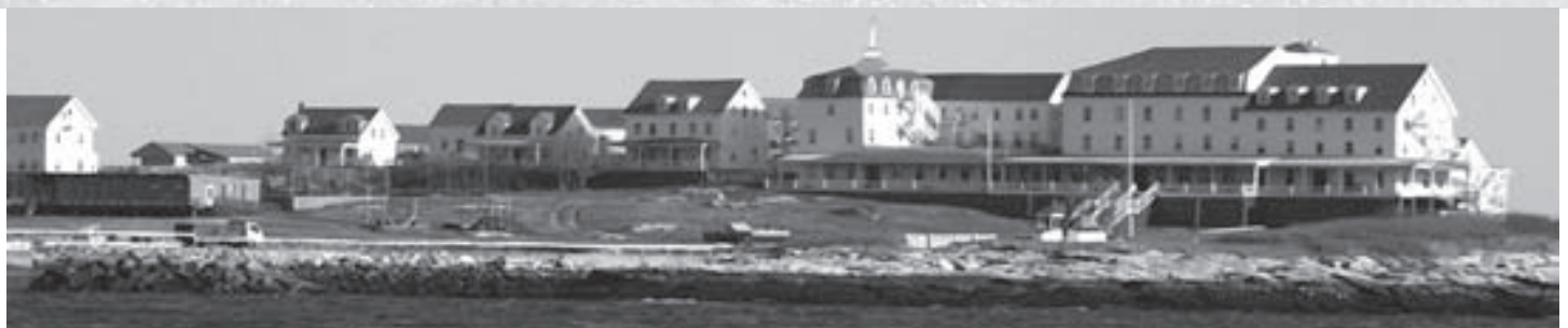
Alluring Star Island with its historic Oceanic Hotel.

Why not turn this event into a perfect "summer weekend getaway"? Portsmouth has historic charm, great shopping, a huge variety of restaurants, a lively night life and lodging for every budget. —ed.