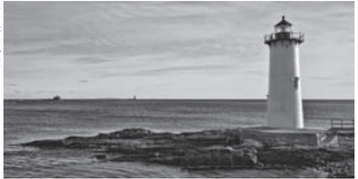
Portsmouth Harbor Light and the Isles on the horizon, nine miles out.

have the ability to sunbathe and swim, enjoy an ice cream from the gift shop, and explore the reconstructed "Gosport Village" (a replica of the old fishing village that once stood on the same site.)