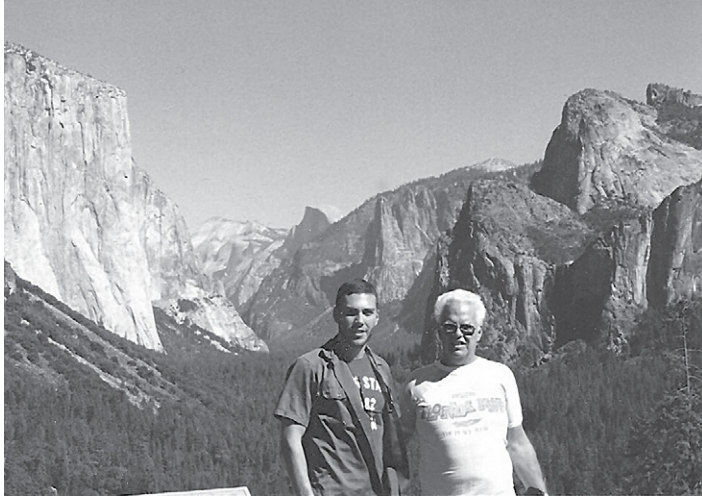
Father and son on a road trip to Yosemite National Park, California.