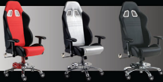
Grand Prix Series Chairs