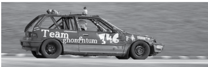
Car #346: Jeff Wasilko, Noah Daniels (NAAC)

When drivers incur infractions, such as car-to-car contact, they must come in and be “judged” and more often than not, are made to do silly penalty actions, like three legged races, before they can resume racing. And if such