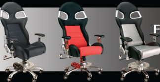
Formula One Series Chairs