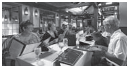
Memories of past Drive & Dines. And where were you?