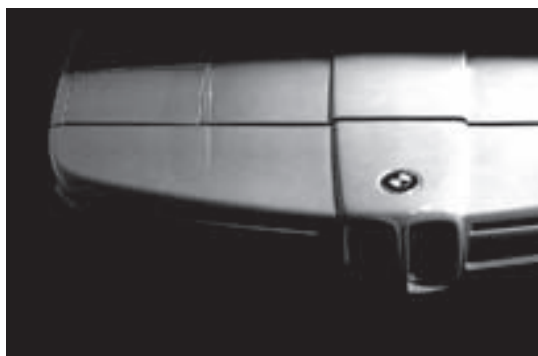
Photographed at the BMW Museum in Munich Germany.

original photo by: Johann Wrede post processing and design by: Martin Callahan