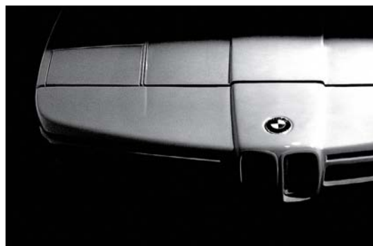
Photographed at the BMW Museum in Munich Germany.

original photo by: Johann Wrede post processing and design by: Martin Callahan