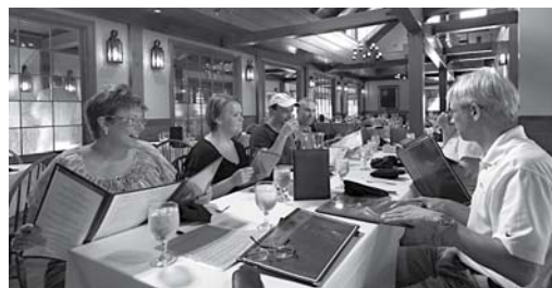
Memories of past Drive & Dines. And where were you?