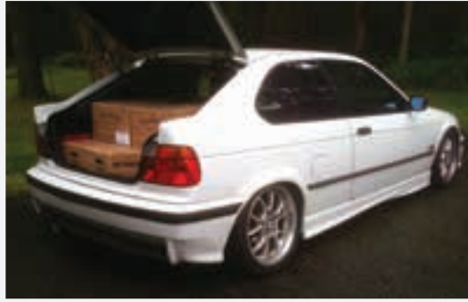
21 cases would have been one too many.