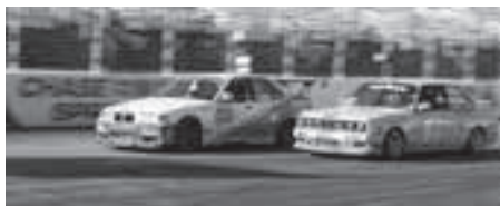
BMW CCA Club Racing Action at NHMS.

This three day school and BMW CCA Club Race at NHMS is your last chance for track time this year. This is a joint event with the Boston Chapter, hosted by our chapter this year. New Hampshire Motor Speedway Loudon, NH. COST: $235/$435/$595 for 1/2/3 days. Register NOW! (until 10/17/13)