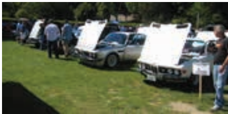
Coupes, coupes, and more coupes.

Those of you who have traveled the New Hampshire seacoast may have seen me driving the Great White, my 1973 3.0 CS. The coupe, as they are often called is a rare sight especially in southern New Hampshire. Only 38,000 or so were built between 1968 and 1975, and most often we "coupers" only drive our cars on sunny days and to car shows, hoping the two will happen on the same day!