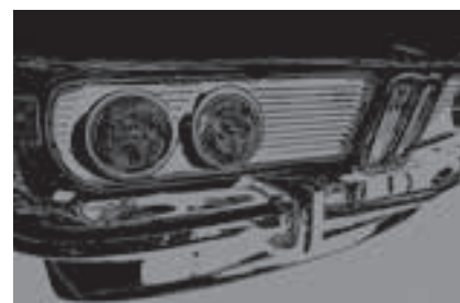
On the lawn of the Larz Anderson Museum.