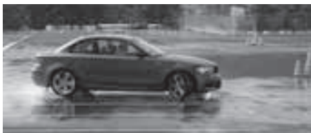
Advanced Driving Skills School at NHMS.

Have fun and learn important car control skills at our Advanced Driving Safety Skills school. New Hampshire Motor Speedway (NHMS). COST: $85. Register NOW! (until 10/02/13)