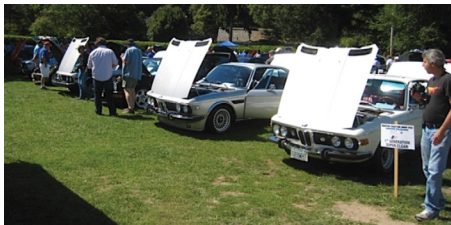
Coupes, coupes, and more coupes.

Those of you who have traveled the New Hampshire seacoast may have seen me driving the Great White, my 1973 3.0 CS. The coupe, as they are often called is a rare sight especially in