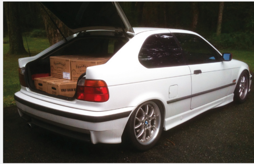
21 cases would have been one too many.