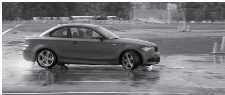
Advanced Driving Skills School at NHMS.

Have fun and learn important car control skills at our Advanced Driving Safety Skills school. New Hampshire Motor Speedway (NHMS). COST: $85. Register NOW! (until 10/02/13)