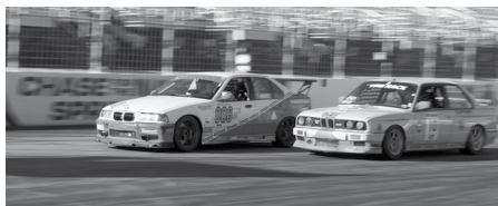
BMW CCA Club Racing Action at NHMS.

This three day school and BMW CCA Club Race at NHMS is your last chance for track time this year. This is a joint event with the Boston Chapter, hosted by our chapter this year. New Hampshire Motor Speedway Loudon, NH. COST: $235/$435/$595 for 1/2/3 days. Register NOW! (until 10/17/13)