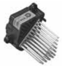
Fig. 8 - Final Stage Unit - Later Design