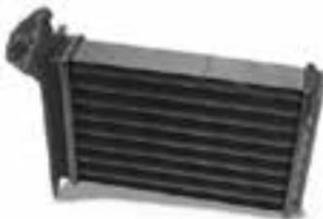
Fig. 4 - Typical Heater Core