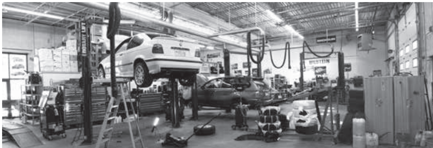
3D Auto Works in Hudson, New Hampshire - A personal, independent service shop of extensive knowledge and resources. Come see for yourself!