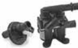
Fig. 3 - Typical Water (Heater) Control Valves