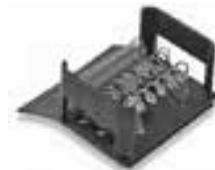
Fig. 6 - Typical Blower Resistor