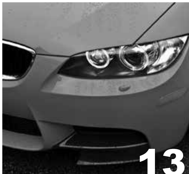
A very rare "M3 Coupe Lime Rock Park Edition" at the Bavarian Autosport Show & Shine.

In 2012 BMW produced and sold only 200 of them as a "celebration of the driving spirit". In addition to the limited edition Fire Orange paint and a long list of performance and style accoutrements, the car's special pedigree is bolstered further by a numbered plaque located on the center console, a unique decal on the left-rear quarter window, and a special certificate of authenticity.