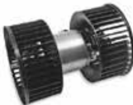
Fig. 5 - Typical Blower Motor Assembly