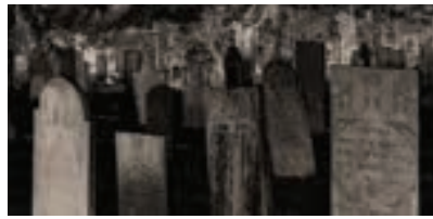
...and we returned to tell about it.

Being true and hardy New Englanders, the SEC announced in advance the October Back Roads Haunted Rally would take place despite any type of autumn weather. Regardless of rain or shine we would gather for a fine meal and drive. Fortunately we avoided the snow of the 2009 rally and the weather accommodated us nicely. By the afternoon we had a seasonal forecast for a pleasant drive.