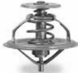
Fig. 1 - Typical Mechanical Thermostat For Early BMWs

tively quick way to decide if you have a valve problem or a heater core problem is to bypass the valve. Remove the input and output hoses from the valve and use a plastic connector nipple or elbow to connect the hoses together. This will mimic a fully open valve. If you now have full heat, either the valve is faulty or the control for the valve is faulty. If all other heat and A/C functions are working properly (just no heat), then it is likely that the valve is faulty. If bypassing the valve makes no difference in your lack of heat, you are likely dealing with a clogged heater core.