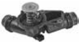
Fig. 2 - Typical Electrically Controlled Thermostat For Later BMWs And MINIs