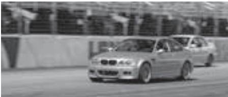
High Performance Driving School at NHMS.