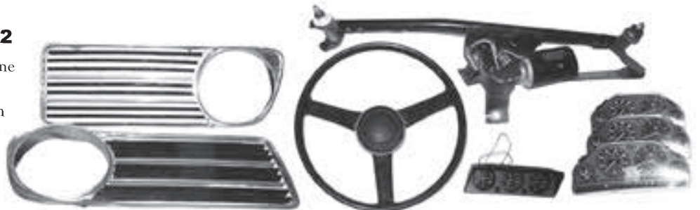
small sample: '74 2002 grills, '74 2002 steering wheel, 325e wiper assembly, '74 2002 gauge console, 325e gauge consoles '84-'86

I have too many parts to list! Please message me any time. I am also looking for a venue to sell the more larger items - fuel tank, transmission etc. Does anybody know of a swap meet style event for BMW people? Call Brian Noel at 603-767-2514 or e.mail Brian via the chapter website.