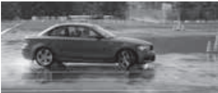
Advanced Driving Skills School at NHMS.

Have fun and learn important car control skills at our Advanced Driving Safety Skills school. New Hampshire Motor Speedway. Questions? Contact registrar@whitemtn-bmwclub.org. COST: $85, Registration opens 02/01/14