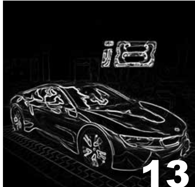
BMW's "electrifying" new i8 at Amelia Island Concours d'Elegance