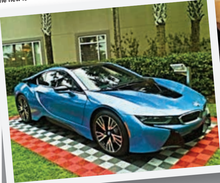
the new i8