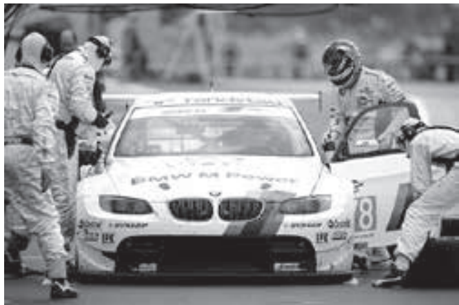
A quick driver change and the race goes on. Thanks for some good laps Rachelle.