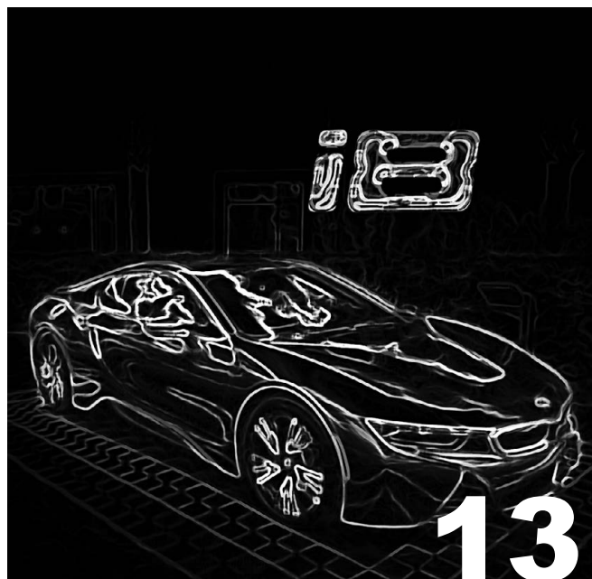
BMW's "electrifying" new i8 at Amelia Island Concours d'Elegance