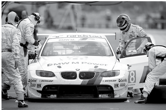
A quick driver change and the race goes on. Thanks for some good laps Rachele.