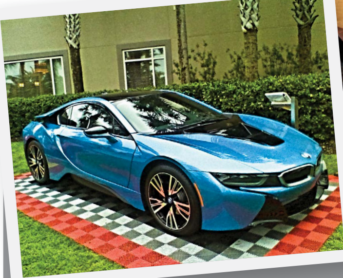
the new i8

Estimated value of the 507 is $1.4 - 1.8 million.