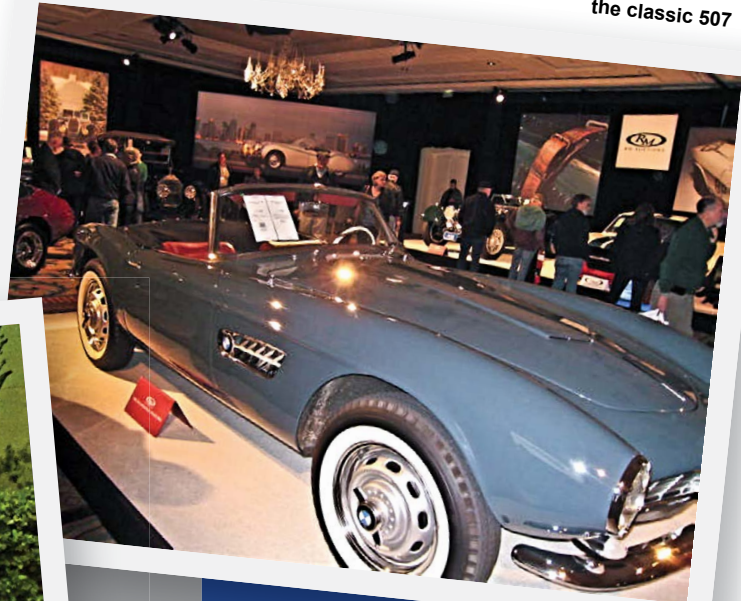
the classic 507