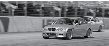
High Performance Driving School at NHMS.