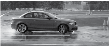
Advanced Driving Skills School at NHMS.

Have fun and learn important car control skills at our Advanced Driving Safety Skills school. New Hampshire Motor Speedway. Questions? Contact registrar@whitemtn-bmwclub.org. COST: $85, Registration opens 02/01/14