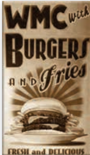
A great combo meal.

you ever been in line at Starbucks the world and with your alma mater's logo emblazoned on their shirt? You can conclude this person likes good coffee and is loyal to your school.