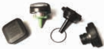
The caps: oil, gas, power steering, radiator

The caps I am noting are 1. gas cap, 2. oil fill cap, 3. radiator cap, and 4. power steering cap. All these should be changed out if your car has reached a certain age (maybe 4 or 5 years). The foursome only cost me $59 for OEM parts. This is cheap insurance and it takes no expertise whatsoever to accomplish the swap. As a bonus I found the M Sport oil cap fits my engine and cost the same as the standard part.