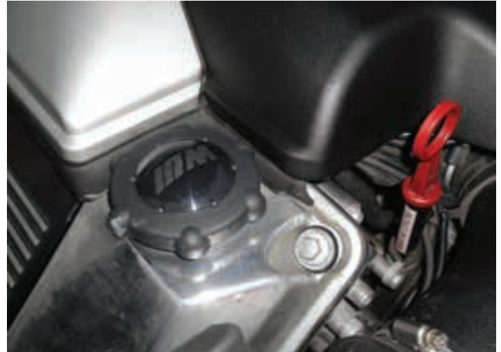
One of the few M Sport parts that cost me the same as the standard part.

Finally, do not overlook the power steering fluid cap. This cap is not as