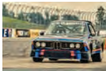
You're only as old as you feel.

post process + design by Martin Callahan