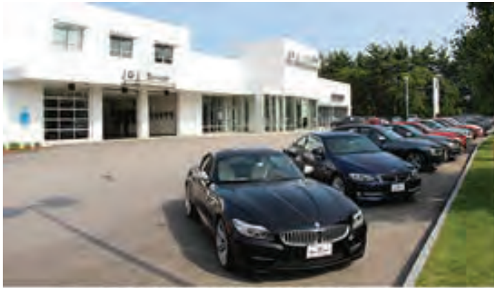
TULLEY BMW OF MANCHESTER 170 Auto Center Rd. Behind Barnes and Noble.