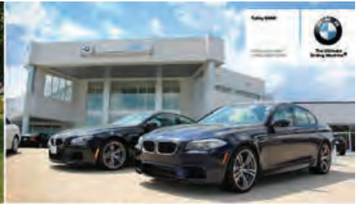
TULLEY BMW OF NASHUA 147 Daniel Webster Hwy. Route 3 to Exit 2.