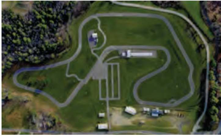
Thrilling by design: The CMC is a 1.3 mile long technically challenging road course with extensive run off areas to promote a safe environment for all track users. The track was designed to run in both directions to give a total of 2.6 miles with nine major turns.