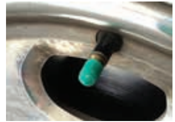
Tires with green valve stem caps are filled with nitrogen, instead of compressed air.

Most likely you will not see any real benefit from nitrogen filled tires, and BMW agrees.