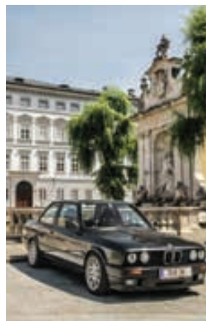
photo by Christopher Callahan post process + design by Martin Callahan

The E30 - the highly successful 3-Series model that BMW produced from 1982 to 1994. Available in various body styles including coupe, convertible, 4-door sedan, and “Touring” (wagon), it was the first 3-Series to offer a diesel engine, and with the 325iX, ground breaking all-wheel drive. The E30 platform was the basis for the first M3.