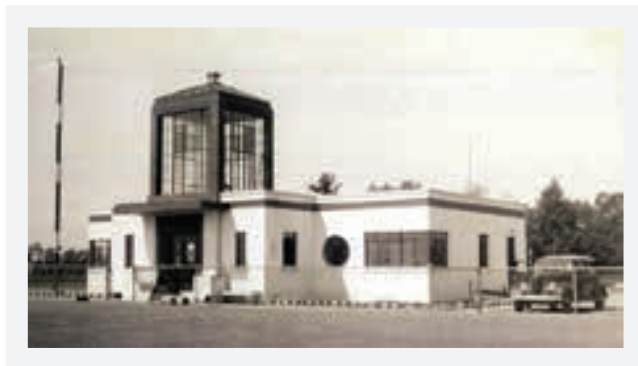
This classic, art-deco 1937 terminal served as Manchester's aviation "front door" until replaced by the Ammon Terminal in 1961. Relocated and restored in 2004 on the east side of the Manchester airport, the building now serves as the Aviation Museum of New Hampshire run by the New Hampshire Aviation Historical Society.

to sit in the (surprisingly comfortable) seats and man the controls. No 6-speed manual transmission is on tap as in the M3 but you can hear live radio traffic from approaching aircraft! There is also a separate flight simulator where some demonstrated their flying skills (or lack thereof), to the entertainment of others who watched.