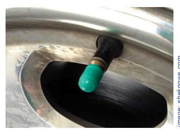
Tires with green valve stem caps are filled with nitrogen, instead of compressed air.

21% oxygen, and 1% other gases. That means compressed air is already mostly nitrogen. Going from compressed air to "pure nitrogen" only increases the concentration of nitrogen and