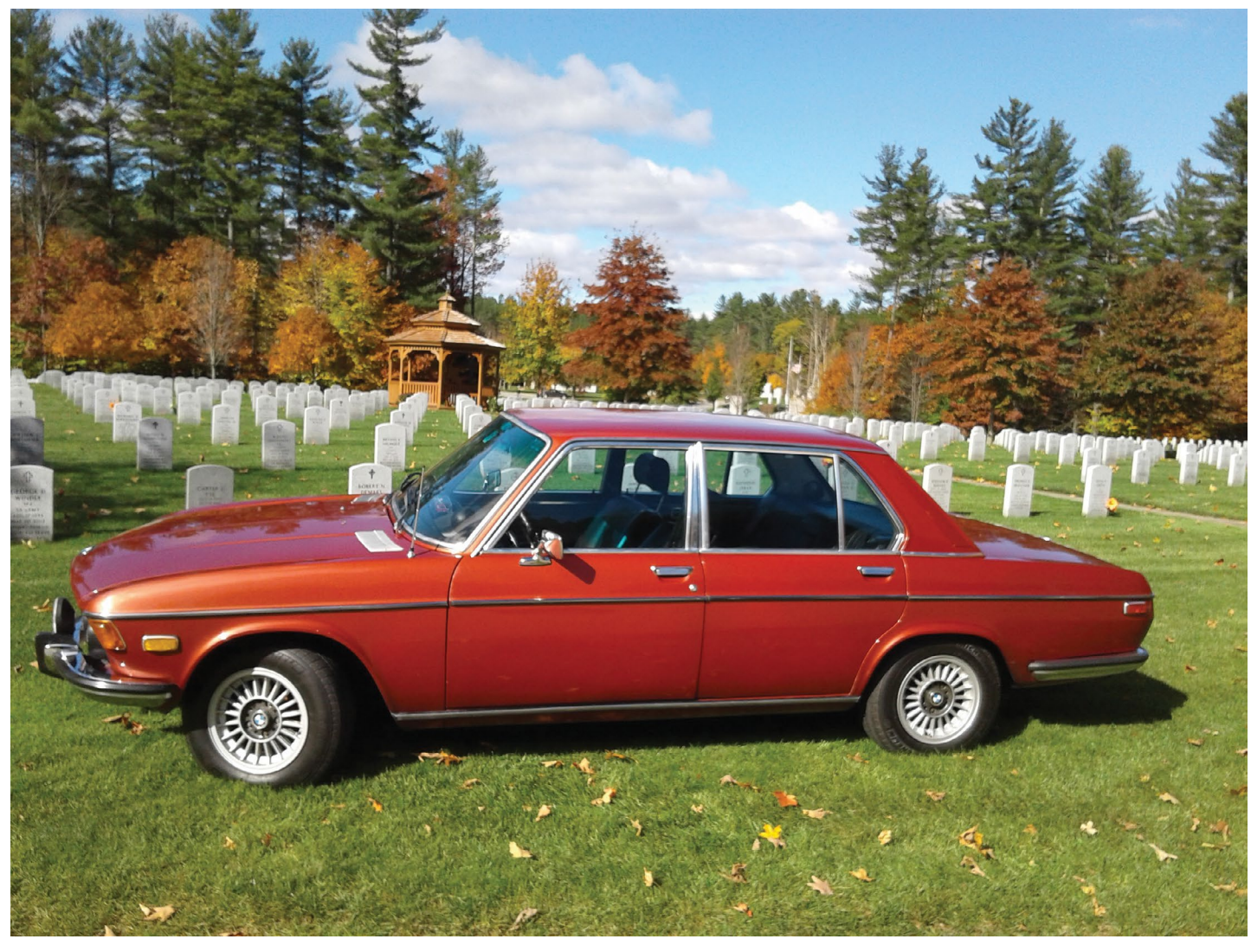
As of October 26, 2016: 184,000+ miles enjoyed over 44 years, 2 months, 2 weeks, 1 day - and still counting!

■ his 1972 BMW Bavaria 3.0 E-3 sedan, VIN 3103761, the "SENIOR6", is my authenticated one-owner, two-driver. I took this photo on October 26, 2016 at New Hampshire Veterans Cemetery in Boscawen, New Hampshire.