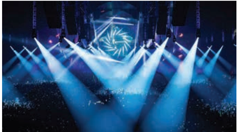
No, this is not what my speakers sound like. If you ask me, mine sound better.

I installed speakers from BAVSOUND and was very impressed with the quality as well as the customer service I contacted several times with questions. BAVSOUND has a slogan: "With our plug & play BMW Audio Upgrades, driving your BMW will never be the same." How true.