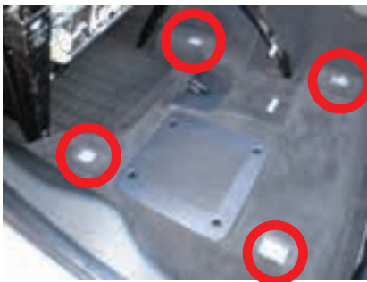
Speaker access couldn't have been more straight forward. Just four bolts to remove the seat.

With my "plug + play" audio upgrade from BAVSOUND, driving my BMW will never be the same.