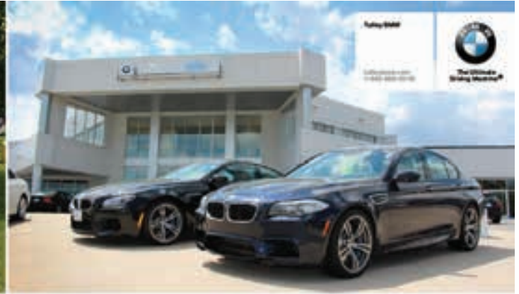
TULLEY BMW OF NASHUA 147 Daniel Webster Hwy. Route 3 to Exit 2.