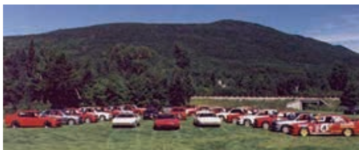
Waterville Valley in the summer of 1997. One of the best O'Fests ever.

www.mtwashingtonautoroad.com/events/climb-to-the-clouds