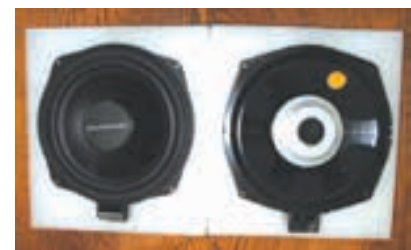
Identically sized. BAVSOUND speaker (L) and original OEM speaker (R).