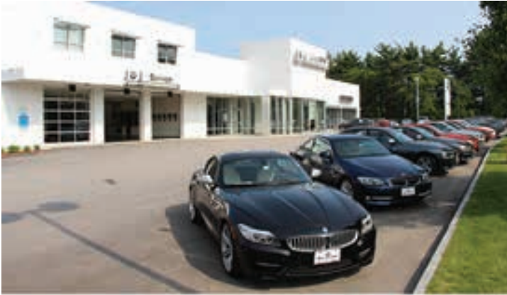
TULLEY BMW OF MANCHESTER 170 Auto Center Rd. Behind Barnes and Noble.