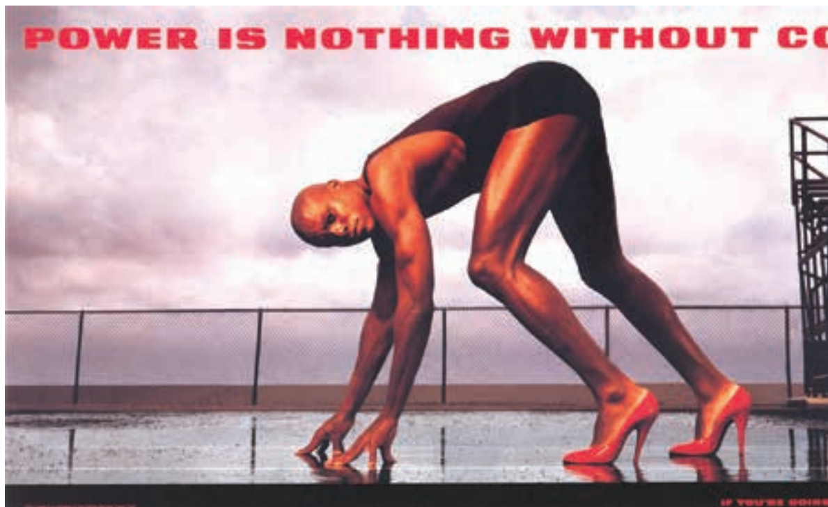
Carl Lewis and Pirelli summed it up perfectly in this early '90s ad campaign.

ADSS, or Advanced Driving Skills School, and HPDE, or High Performance Drivers Education, are the definitions of the two acronyms that I introduced at the start of this article. Street Survival and ADSS are very similar driving schools, with Street Survival being setup for drivers with a learners permit to 21 years of age, and ADSS for drivers with a few years, to decades of experience on the road. The ADSS and Street Survival schools take place in a parking lot where speeds rarely exceed 35 mph, whereas HPDE takes place on a race track and speeds can go beyond 100 mph. All the schools are focused on giving the driver new skill sets, skill sets that make driving safer then at the start of the school. Plus you will have fun mixed in and a new appreciation for the capabilities of your BMW, while being taught in a safe environment.