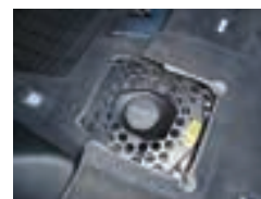
...and a few minutes later. (R)

[You can read part 1 of this two-part series in the 2016.2 (Apr-Jun) edition of the Profile. Back issues of the Profile can always be found on the chapter website. -ed.]