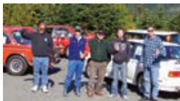
Some of the WMC drivers at the summit in 2007. Smiling because it was a blast, or simply because they stayed on the road?

speeds up the precarious Mount Washington Auto Road.