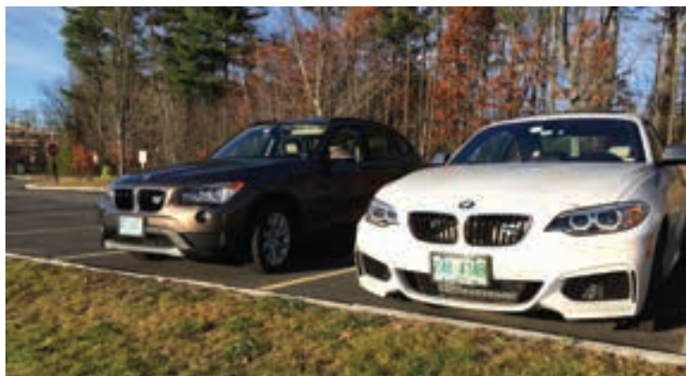
A happy family affair.

X1: Wunderbar, that's where I'm from too! Born in eastern Deutschland, they call me Angela. I was put together extremely well, not a squeak or loose screw these past two years. No warranty issues either. I suspected a new garage mate was in the works six weeks ago after the Subaru departed. Not a bad machine, but a bit