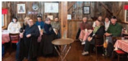
The WMC’s perennial pilgrimage to Parker’s. - No sweeter way to kick off the new driving season.

“wood stove corner”. Fresh maple syrup, stuffed French toast and Parker’s specials for all. Yum.