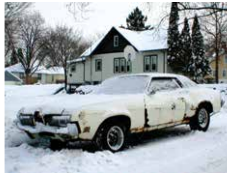
A quintessential winter beater

So how then does a person get around and carry on the activities of daily winter driving? Today there are endless options: SUVs, AWD, 4WD, front wheel drive, etc. Without naming names the list is almost endless.