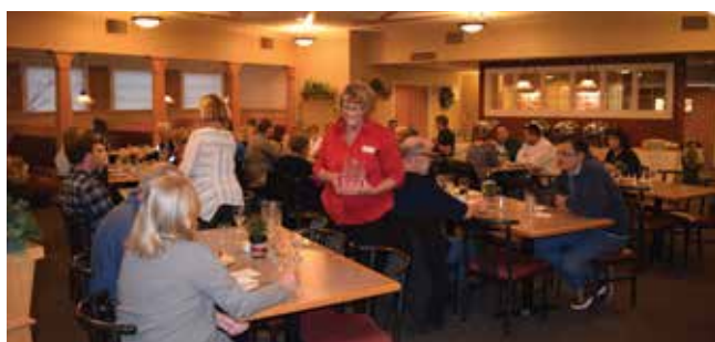
Friday night Meet & Greet at Smuggs was well attended

The annual Green Mountain chapter OktoberFAST is now just a memory. Planning for the event began sometime around March, when we approached the Stowe (VT) Rotary Club about joining them during their Oktoberfest celebration. Maybe there was room on the events field for a German car show that we host annually, and call OktoberFAST? The Rotary was excited about the prospect, so we marked our calendar for September 29 through October 1 and set about putting together an awesome weekend.