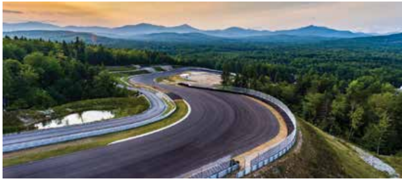
The grandeur that is Club Motorsports

On September 25th, the WMC hosted its inaugural event at the track for HPDE instructors and advanced level students to